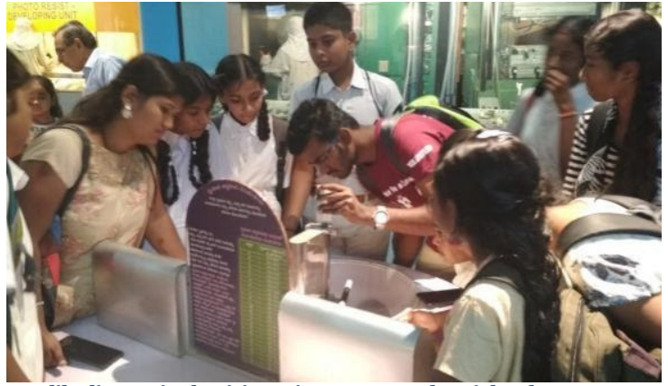
Haadibadi organized a visit to Visvesvaraya Industrial and Technological Museum for the students of Round Table School in November 2019.